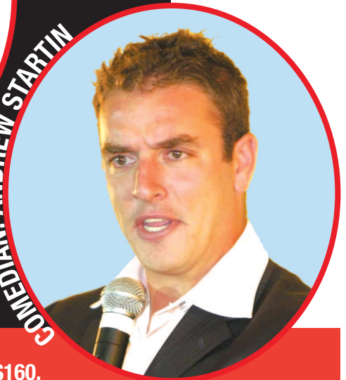
COMEDIAN: ANDREW STARTIN

Corporate Table Packages - $2600 for 12 people. General Tickets $160.